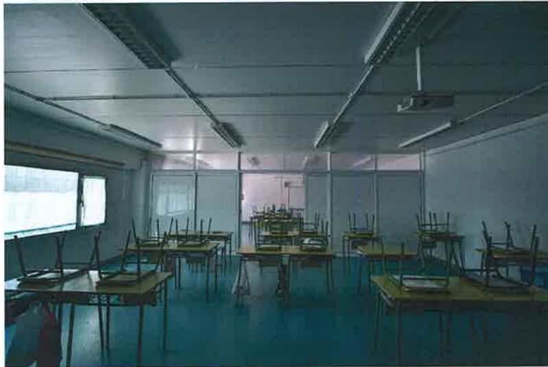
An Empty Classroom

The coronavirus is continuing to spread around the world. The coronavirus spreads from person to person. People who have the coronavirus may go to events with big crowds and spread the coronavirus to other people. Many leaders are canceling events with big crowds, hoping to stop the coronavirus from spreading. The events include parades, festivals, concerts, sports events and more. Many schools and businesses are closed too. If a school is closed, the students do not go to the school building. They may do classes online from home instead. Some people may have to work online from their homes instead of going into office buildings.